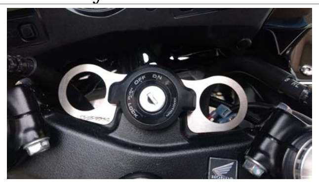
A: Bracket W/O Accessories