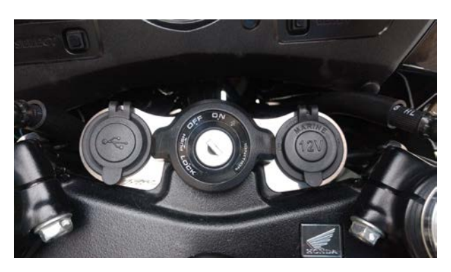
B: Bracket W/Accessories (Not Included)